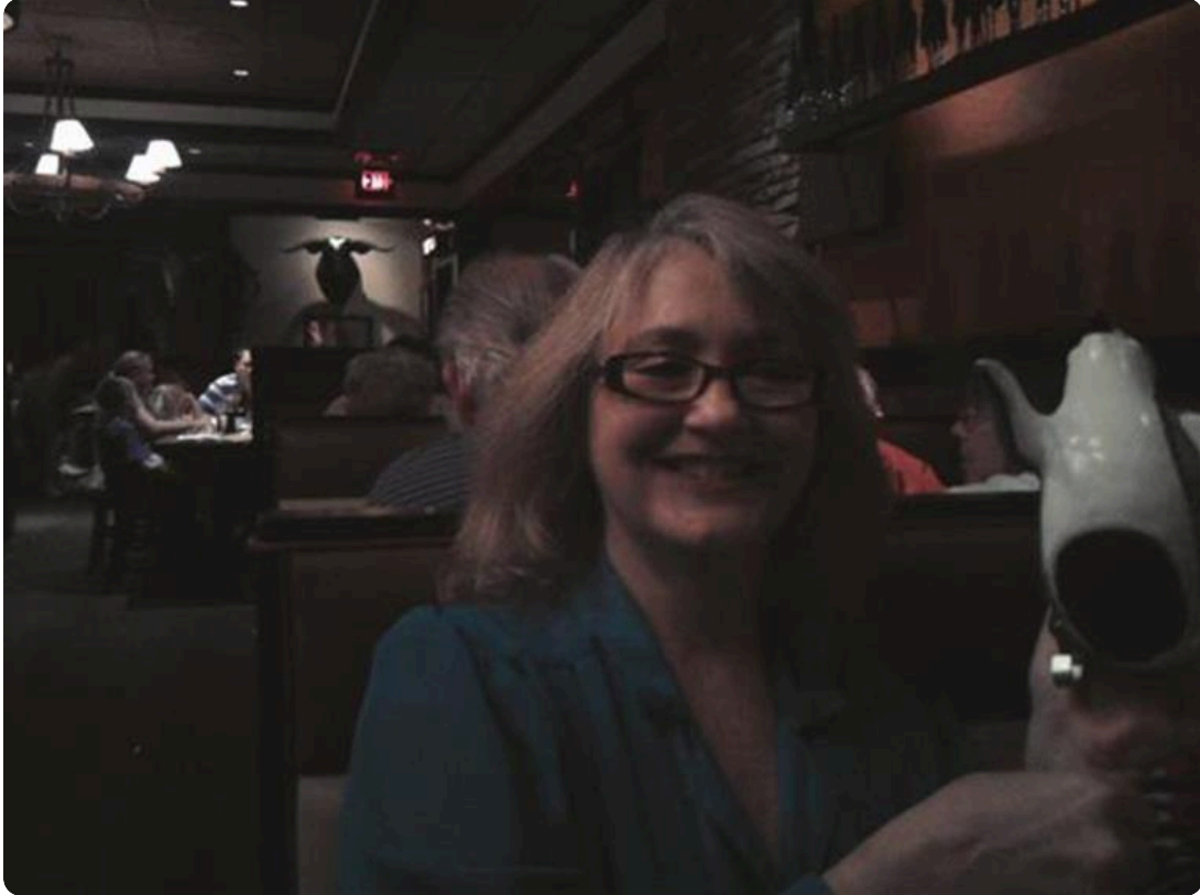
Suncoast Girls Christmas 2011